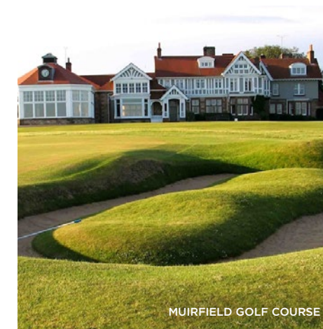
MUIRFIELD GOLF COURSE

Take to the green for a round of golf at the stunning Castle Stuart Championship course. The spectacular setting overlooking the Moray Firth presents a memorable seascape punctuated with local landmarks such as the Kessock Bridge, Chanonry Lighthouse, Fort George and Ben Wyvis. Non-golfers, enjoy a day of Highland sightseeing at its best. Start with a visit to Cawdor Castle, romantically linked to