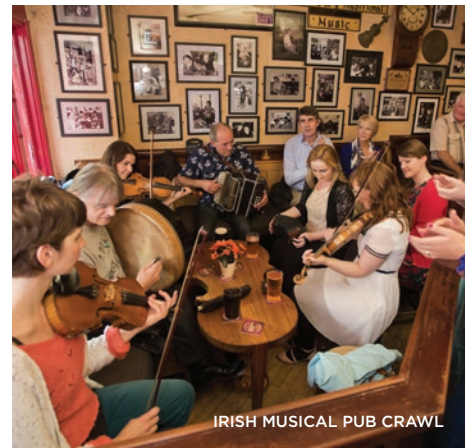
IRISH MUSICAL PUB CRAWL